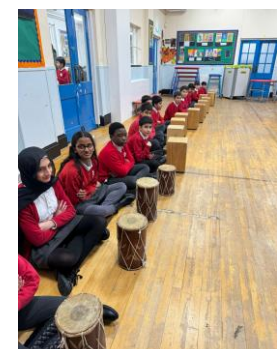
Diwali Drummers from Year 6.