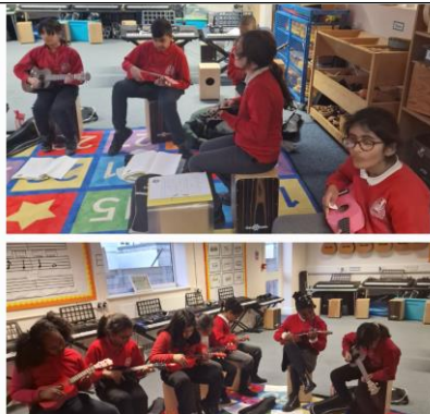
MUSIC CLUB AFTER SCHOOL!

Please ensure that pupils attend their class interventions after school and other clubs.