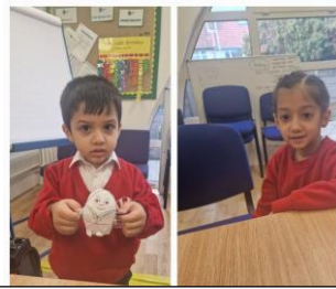
Humpty Dumpty by Nursery children