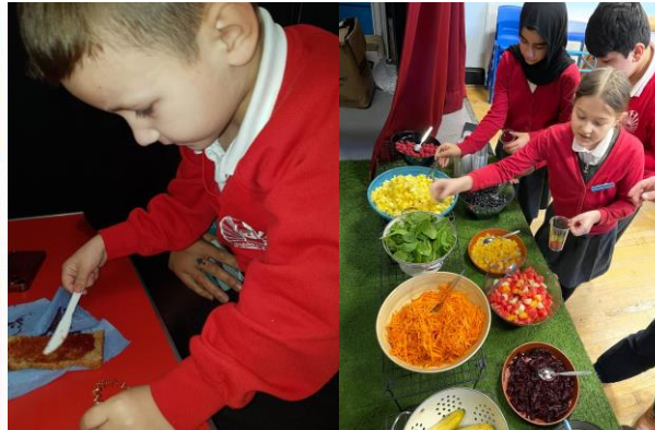
A variety of learning and pupil engagement throughout the week.