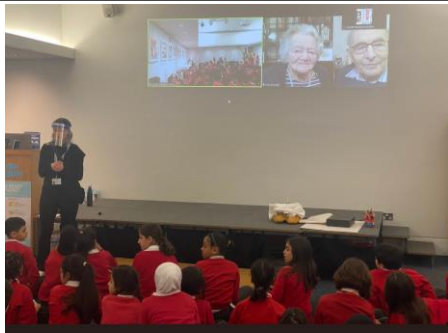
YEAR 5 PUPILS AT JEWISH MUSEUM