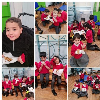
Pancake Day for Year 1

Mother and grandmother who visited on World Book Day