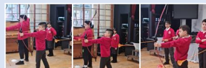
ARCHERY CLUB AND YEAR 1 WRITERS