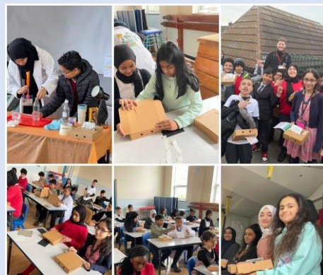
Science Day and Careers Week photos.

Tuesday the 15 th to Thursday 17 th March, we will hold our Parent's Evening. Please book your Parents Evening appointments as you will be able to have face to face meetings with your child's teacher. The appointments will take place in your child's classroom.