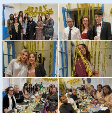
Christmas Jumper and Celebration