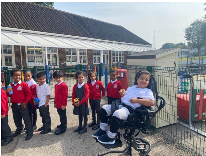
YEAR 1 PUPILS ARE SETTLING IN VERY WELL IN THEIR RITUALS AND ROUTINES.

We would appreciate if parents check the girl's PE kit as leggings/tights should not be worn for PE lessons. It is jogging bottoms for all pupils.