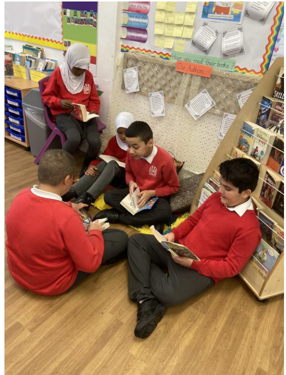
Our Readers from Year 5 enjoying their Reading Challenge.