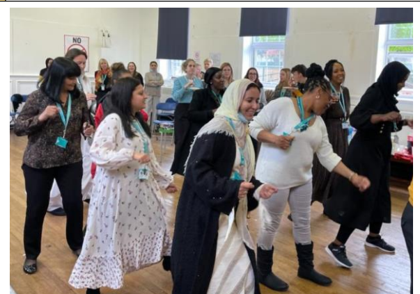
Dancing in their Bubbles celebrating EID...