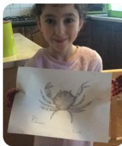
Art homework .