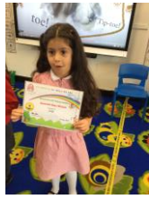
Emerald Spelling Bee Champion