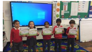
Jade Class Spelling Bee